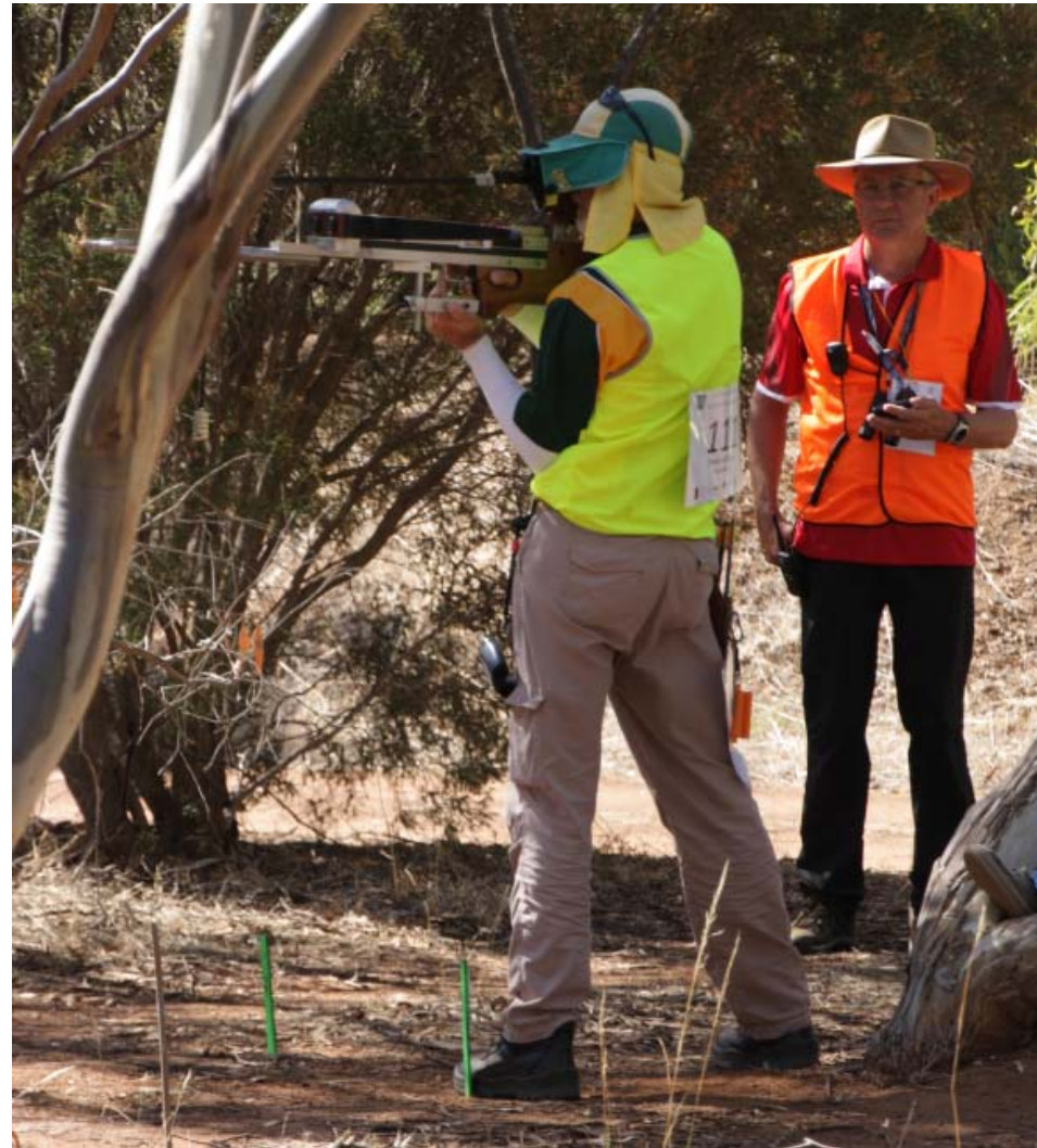
2020 WCSA Judges Seminar